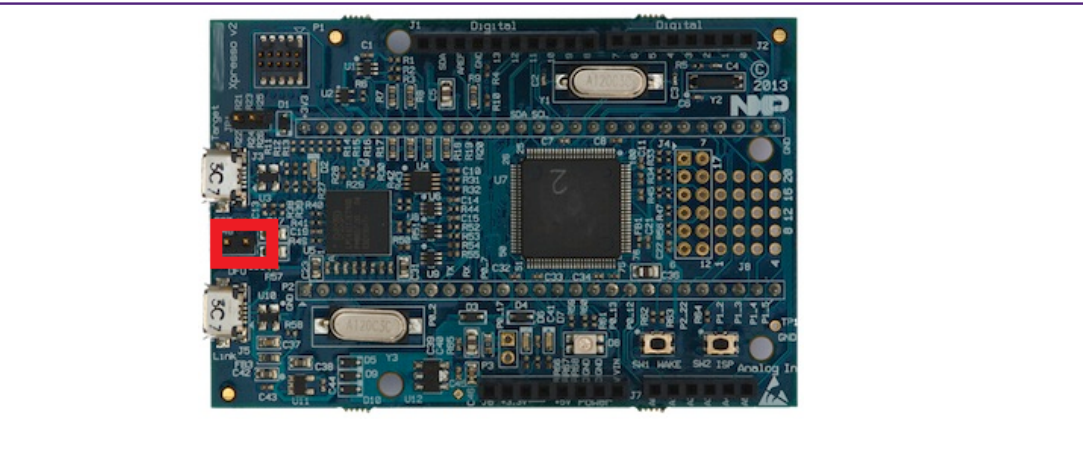
Figure 6.1. LPCXpresso V2 DFU Boot

Then connect the board to your host computer over the debug link USB connector and in a command shell run either: