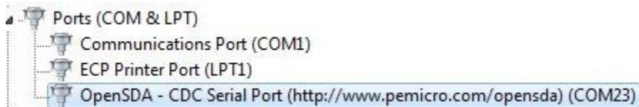
Figure 2. Alternate UART connection to Kinetis platform