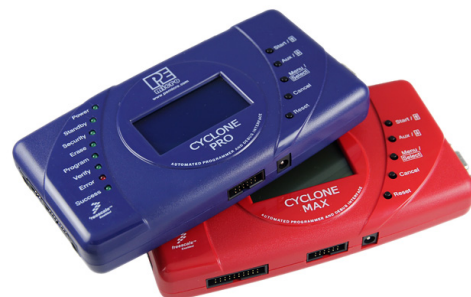
Cyclone PRO & Cyclone MAX

The USB Multilink Universal and Universal FX are intended for development and are not designed to accommodate the demands of production programming. However, P&E's Cyclone programmers are specifically engineered to withstand the rigors of a production environment and will provide a seamless transition from the Multilink. More information is available online at pemicro.com/cyclonepro and pemicro.com/cyclonemax .