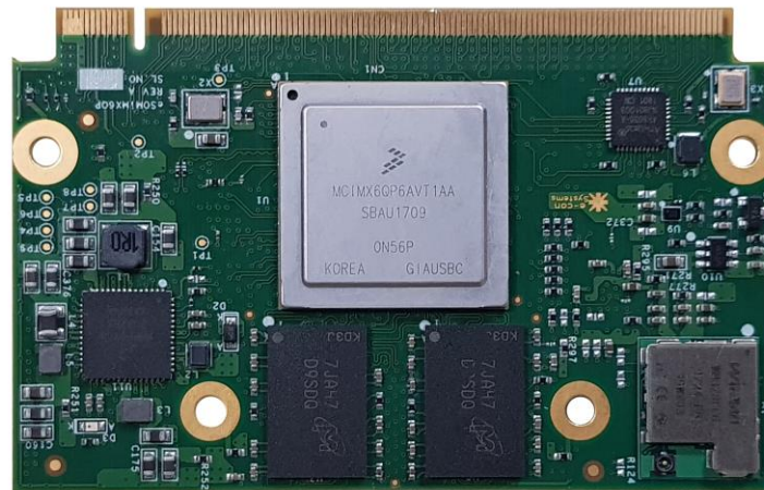
Fig 1 – eSOMiMX6PLUS – i.MX6 QuadPlus/DualPlus Computer on module

eSOMiMX6PLUS is a ready to use System-On-Module using Quad Plus or Dual Plus ARM Cortex™ A9 Processor running up-to speeds of 1.2GHz. This System-On-Module encompasses eMMC Flash whose capacity ranges from 4GB to 64GB and 64-bit DDR3 with capacity as low as 256MB to as high as 4GBytes. e-con's i.MX6 System-on-Module is available with Linux and Android BSP.