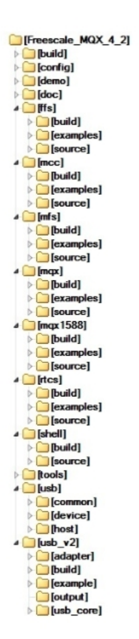
Figure 1. Freescale MQX RTOS Directories